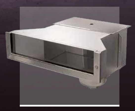
High water level skimmer