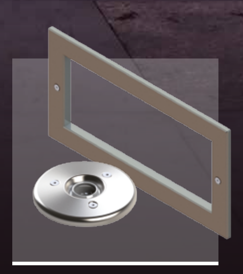
Embellishers for ABS pool fittings